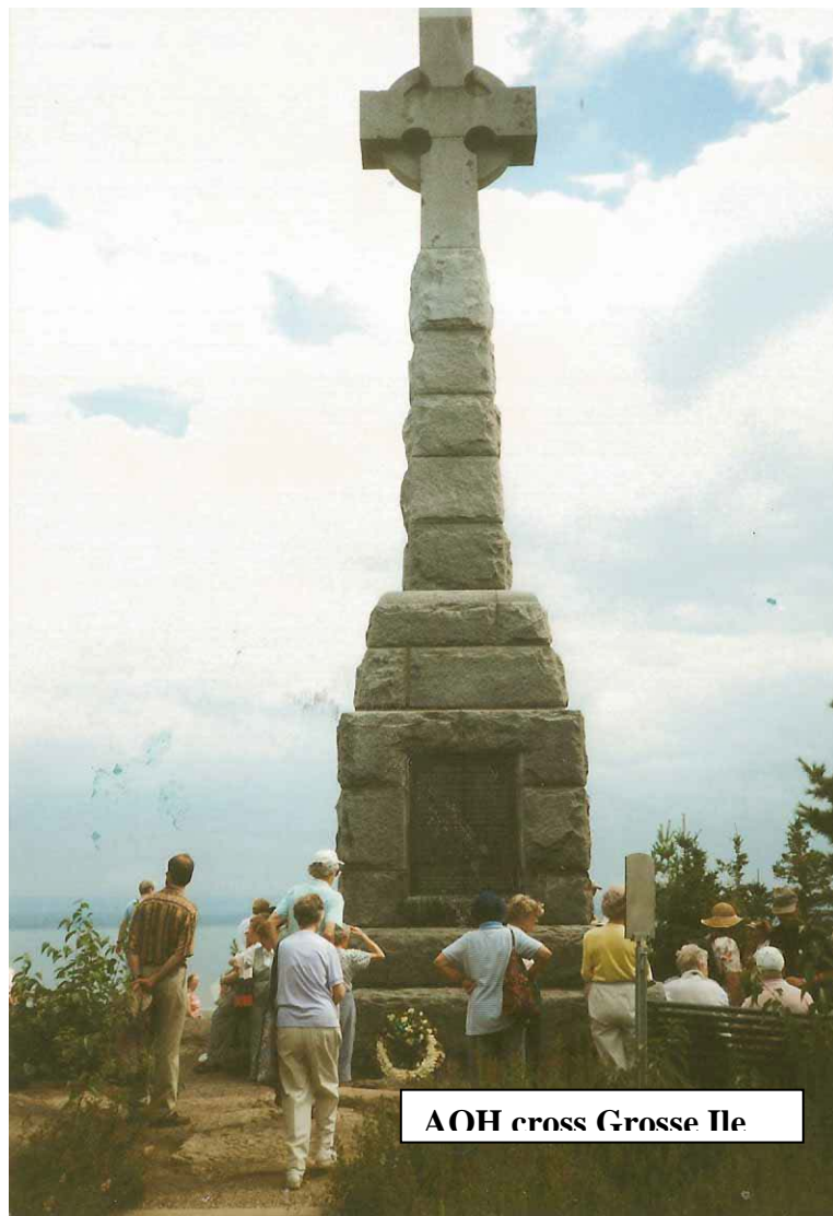
AOH cross Grosse Ile

It is intended from there that the stone will go on display at Our Lady of Lourdes Parish and Our Lady of Fatima Parish in Coquitlam (Francophone) and St Patrick’s Parish (Irish) in Vancouver till it can be transferred for inclusion to the Ireland Monument – Canada. The committee hopes this will provide the opportunity for those in the Irish and Francophone communities and others in the Lower Mainland of Vancouver to view the stone.